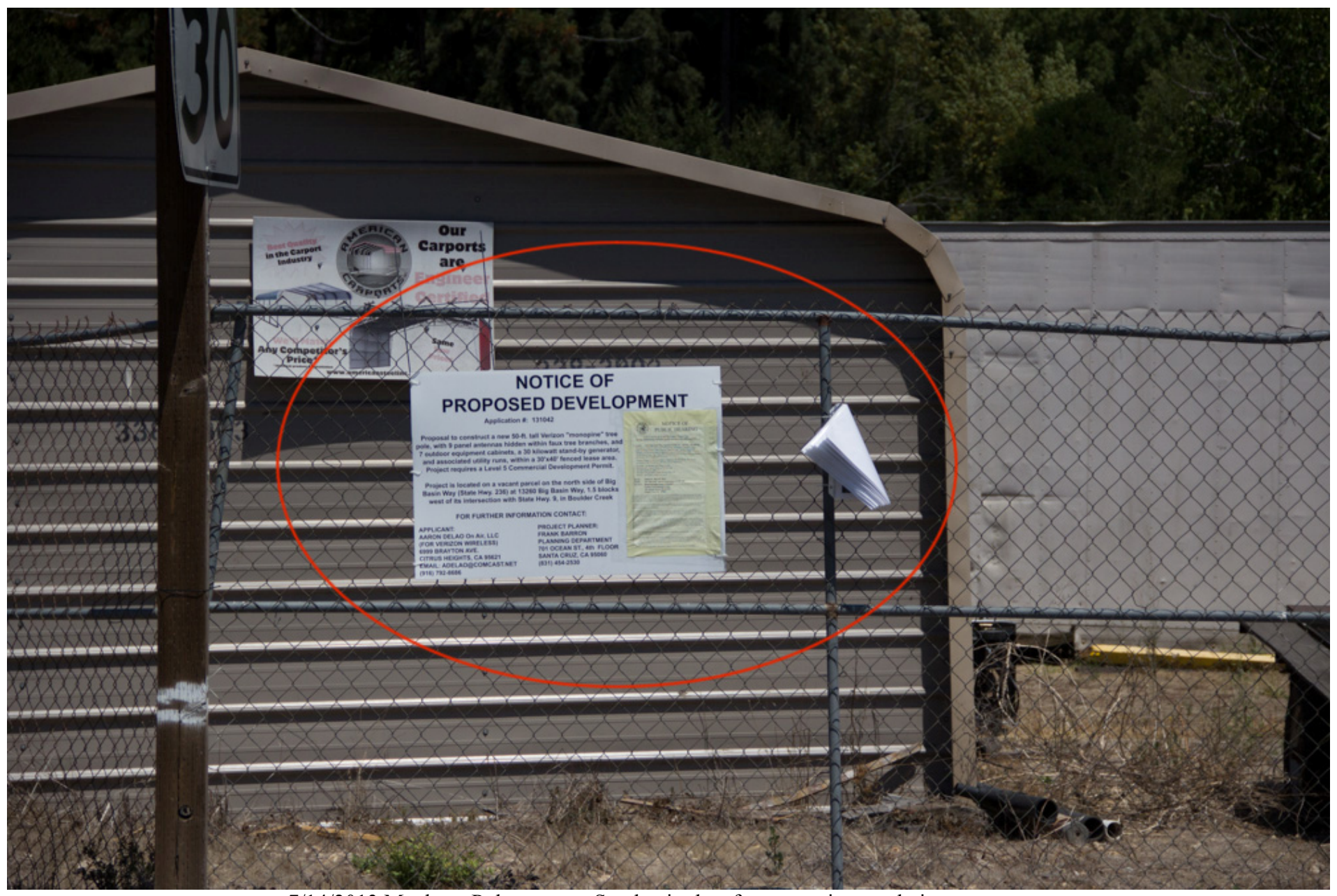
7/14/2013 Mock-up Pole went up Sunday in the afternoon, signs and pictures present