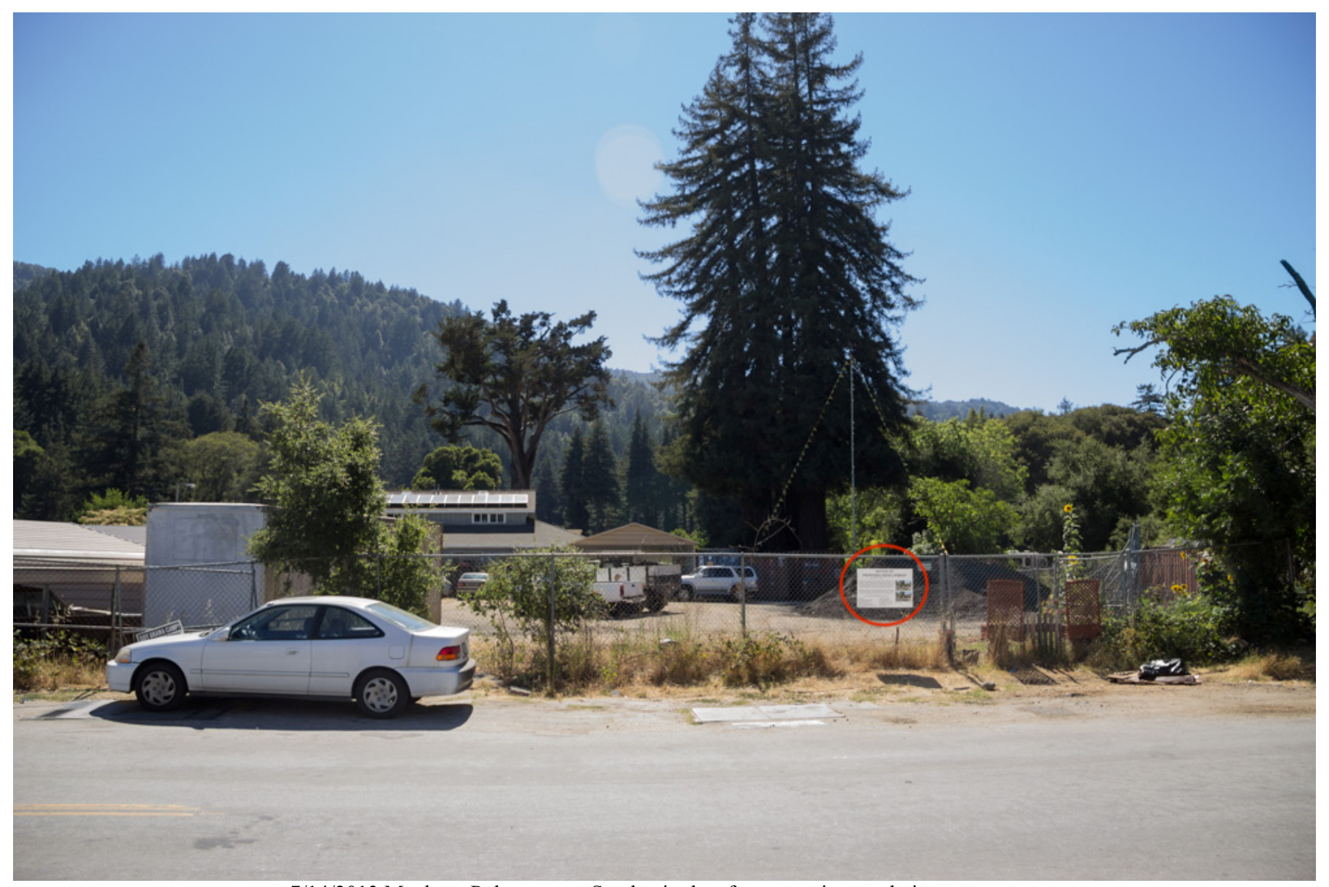
7/14/2013 Mock-up Pole went up Sunday in the afternoon, signs and pictures present