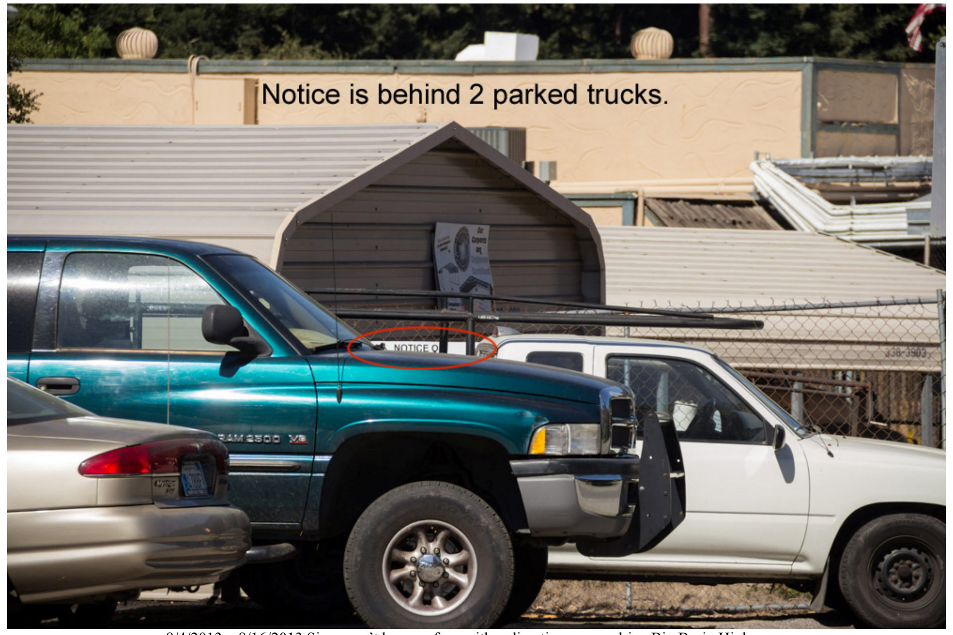
8/4/2013 – 8/16/2013 Signs can't be seen from either direction as you drive Big Basin Highway

Picture of Big Basin Highway going East, different angle