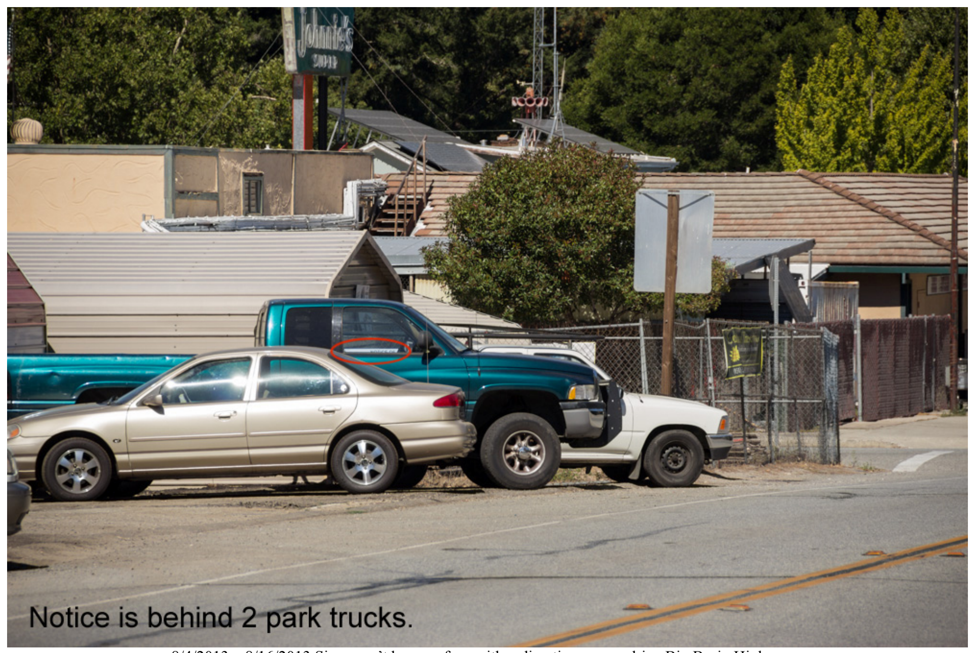
8/4/2013 – 8/16/2013 Signs can't be seen from either direction as you drive Big Basin Highway