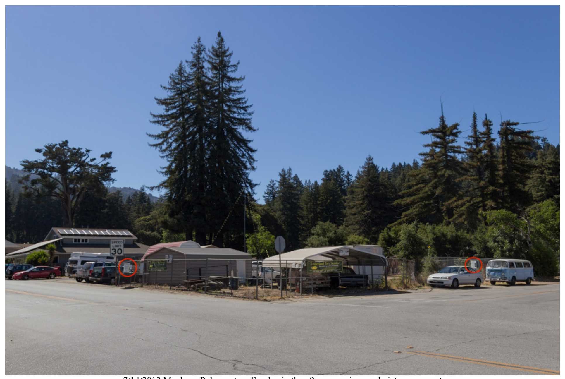
7/14/2013 Mock-up Pole went up Sunday in the afternoon, signs and pictures present