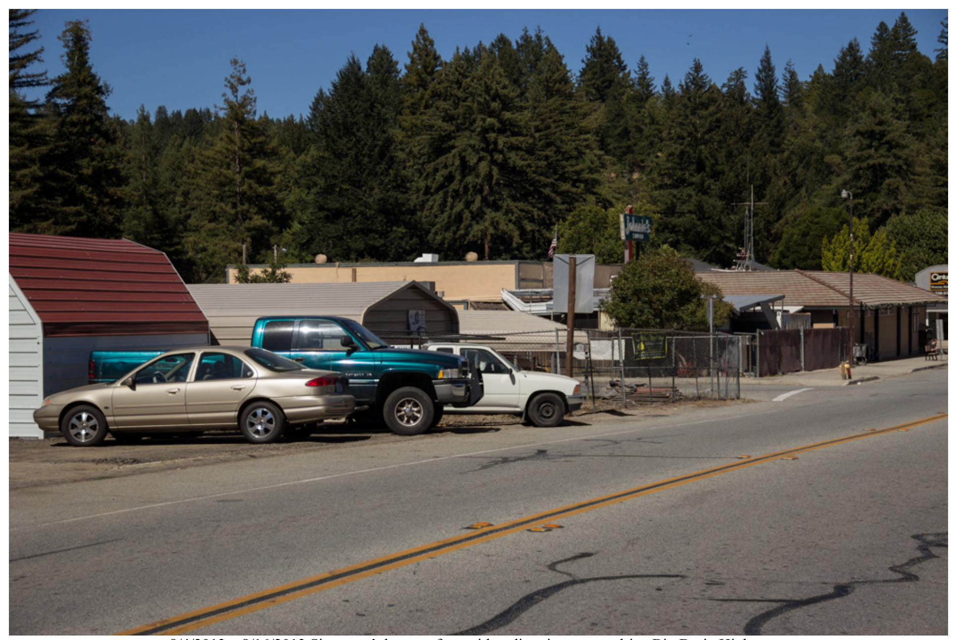
8/4/2013 – 8/16/2013 Signs can't be seen from either direction as you drive Big Basin Highway

Picture of Big Basin Highway going East, different angle