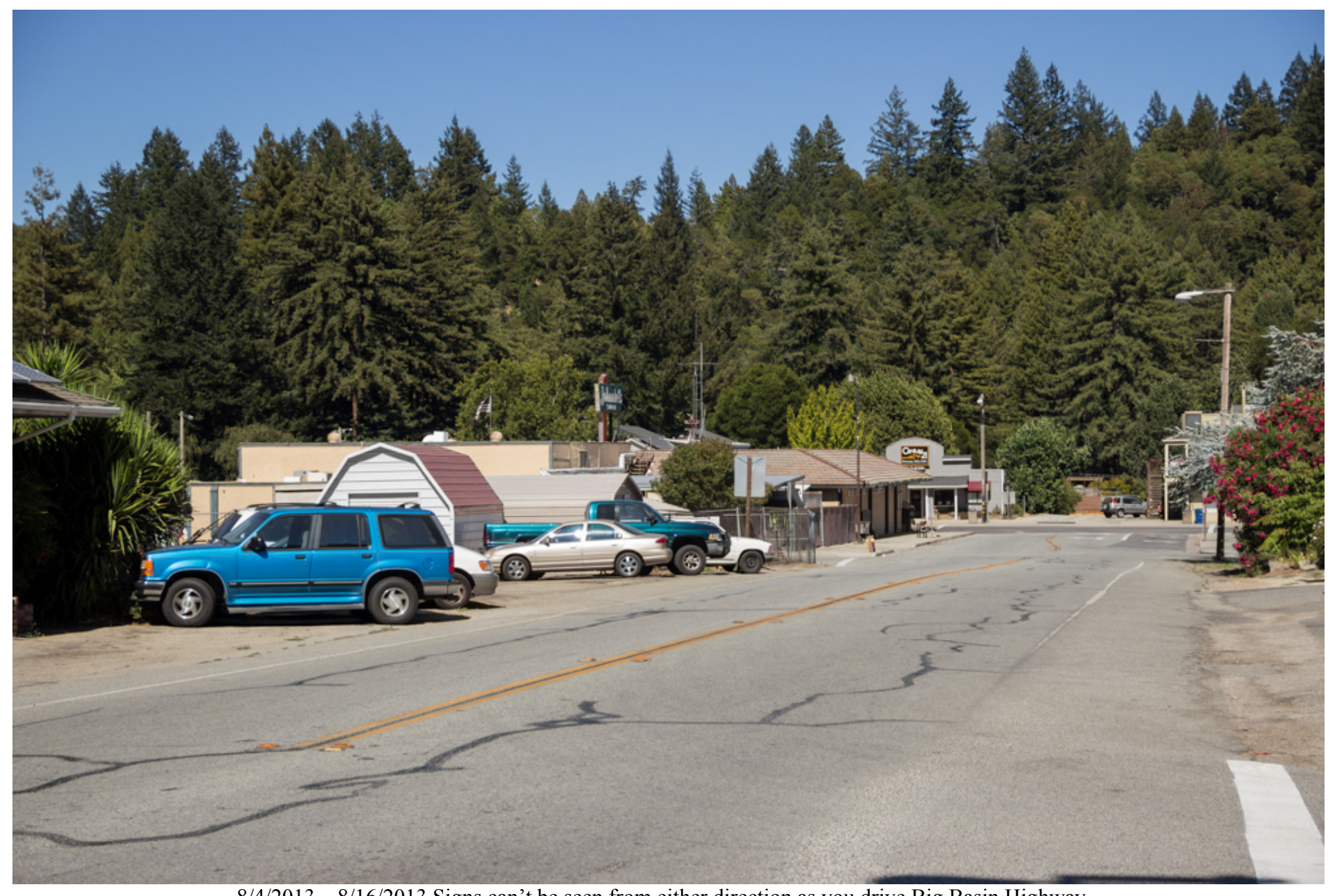
8/4/2013 – 8/16/2013 Signs can't be seen from either direction as you drive Big Basin Highway