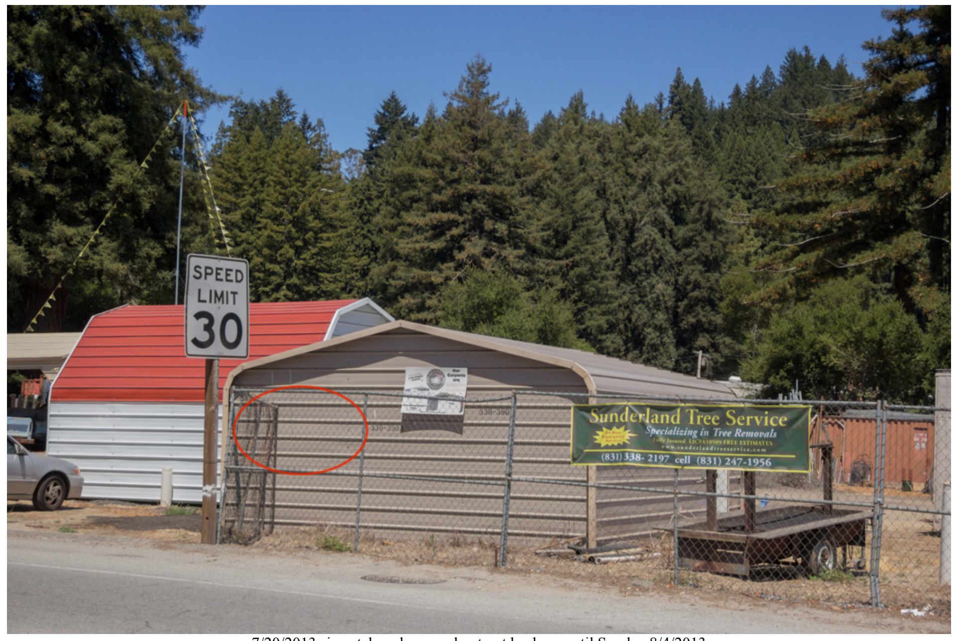
7/20/2013 signs taken down and not put back up until Sunday 8/4/2013