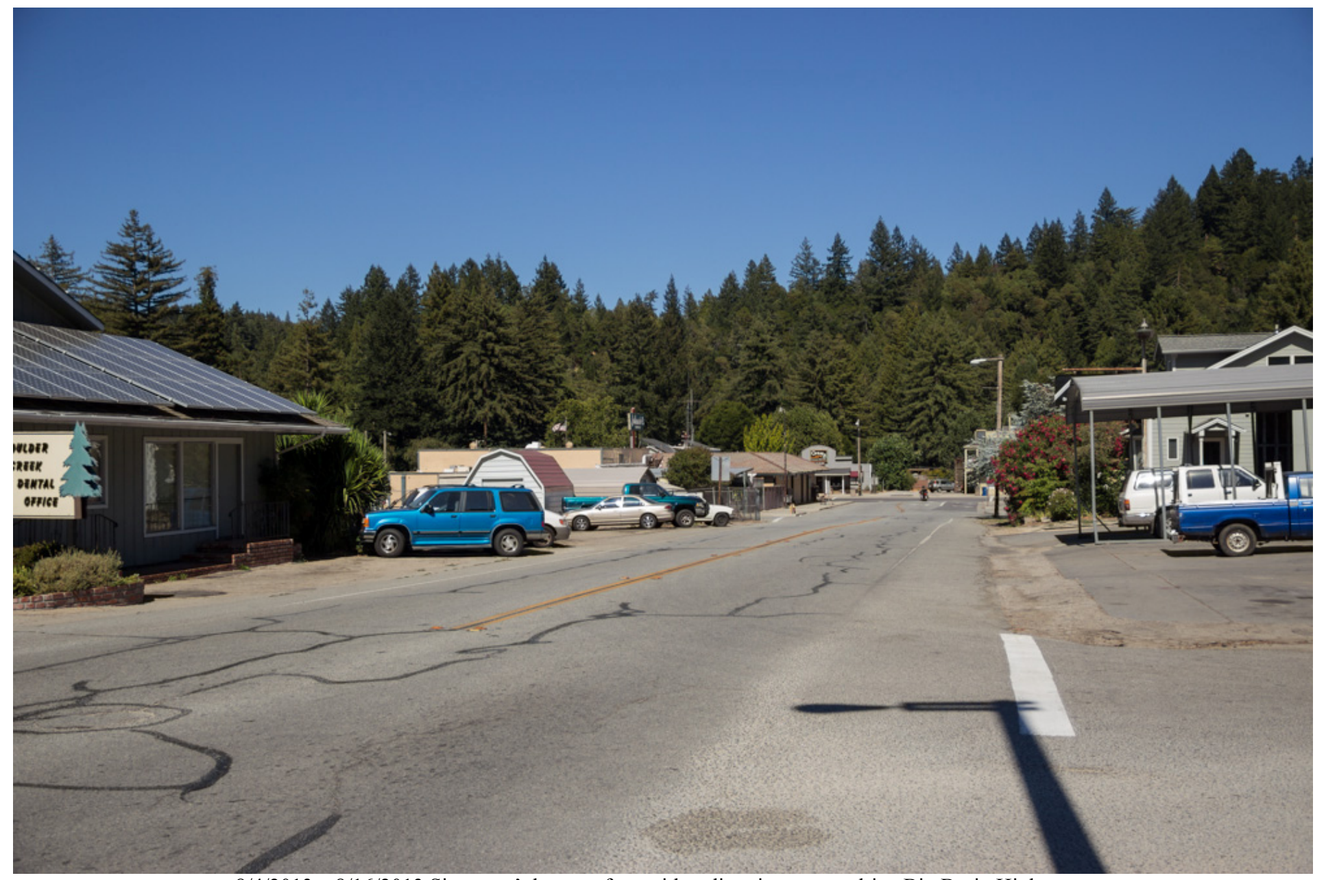
8/4/2013 – 8/16/2013 Signs can't be seen from either direction as you drive Big Basin Highway