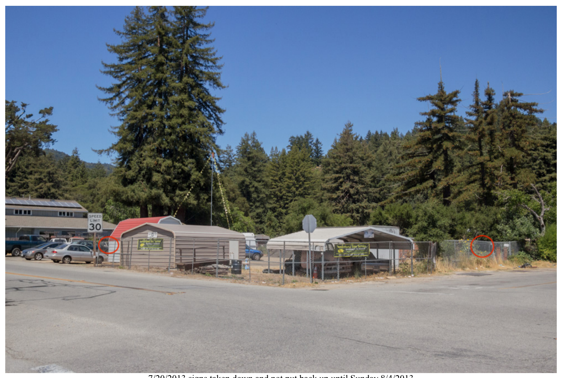
7/20/2013 signs taken down and not put back up until Sunday 8/4/2013