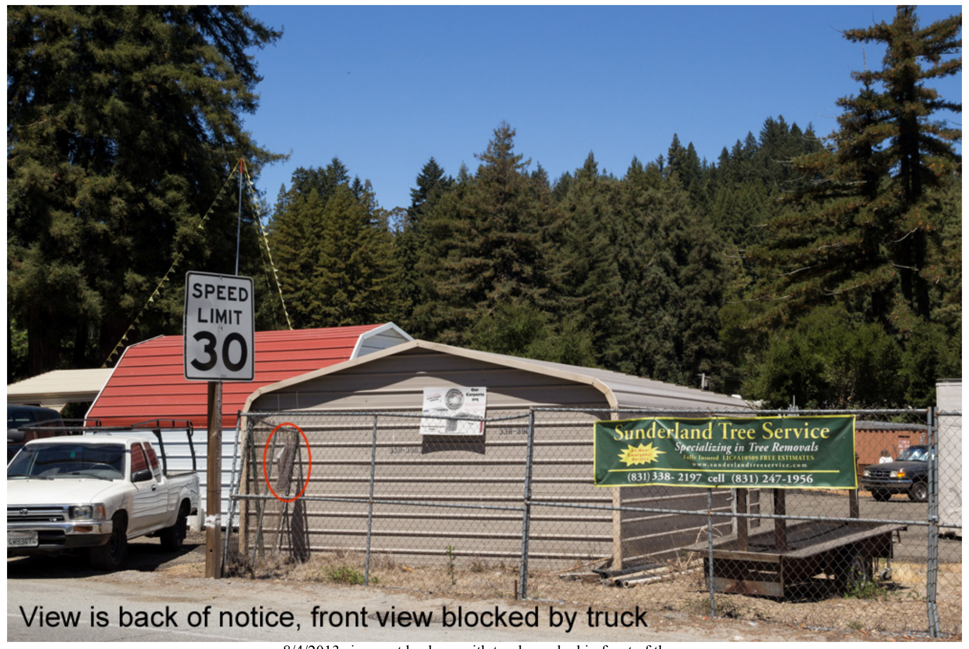
8/4/2013 signs put back up with trucks parked in front of them