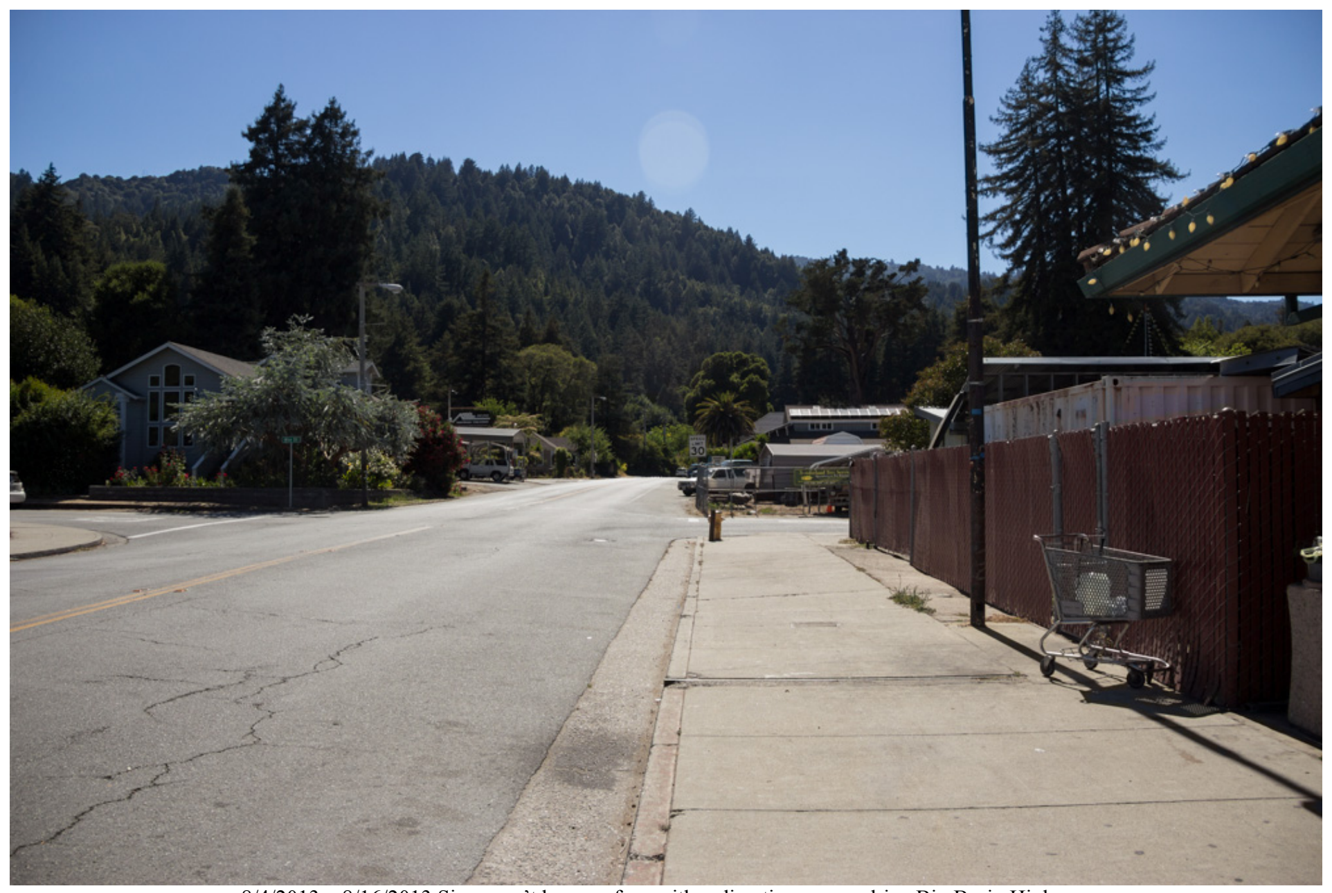
8/4/2013 – 8/16/2013 Signs can't be seen from either direction as you drive Big Basin Highway