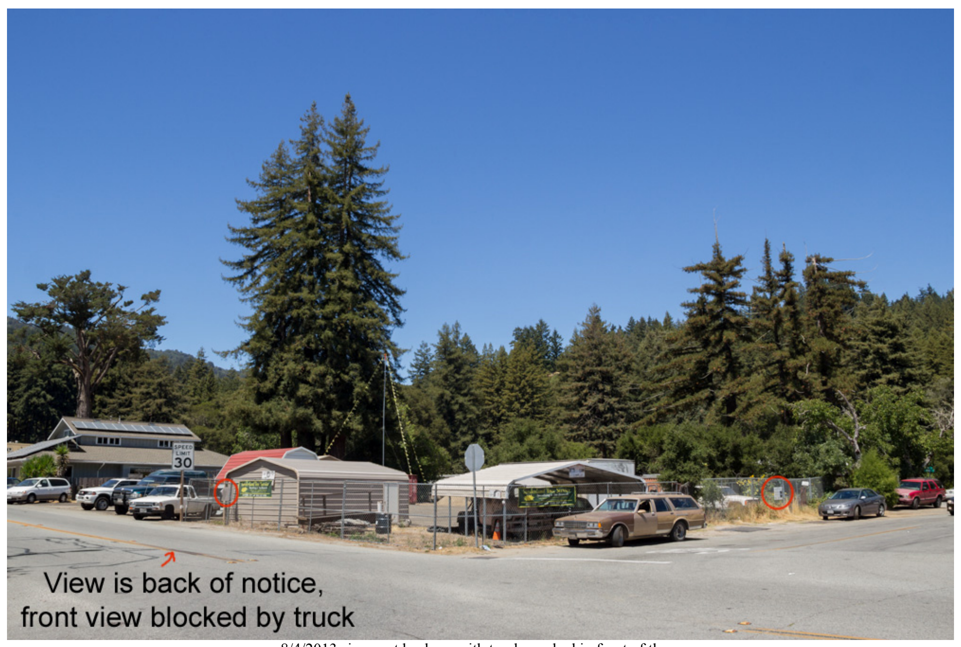
8/4/2013 signs put back up with trucks parked in front of them