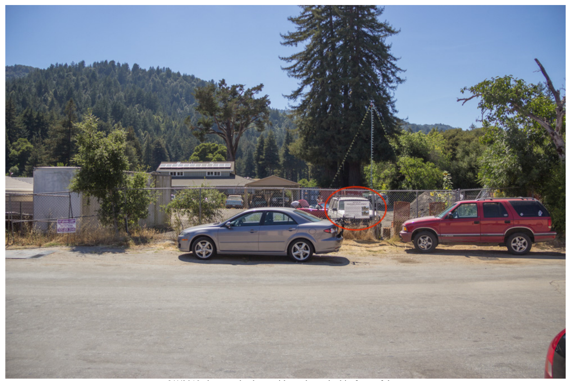
8/4/2013 signs put back up with trucks parked in front of them