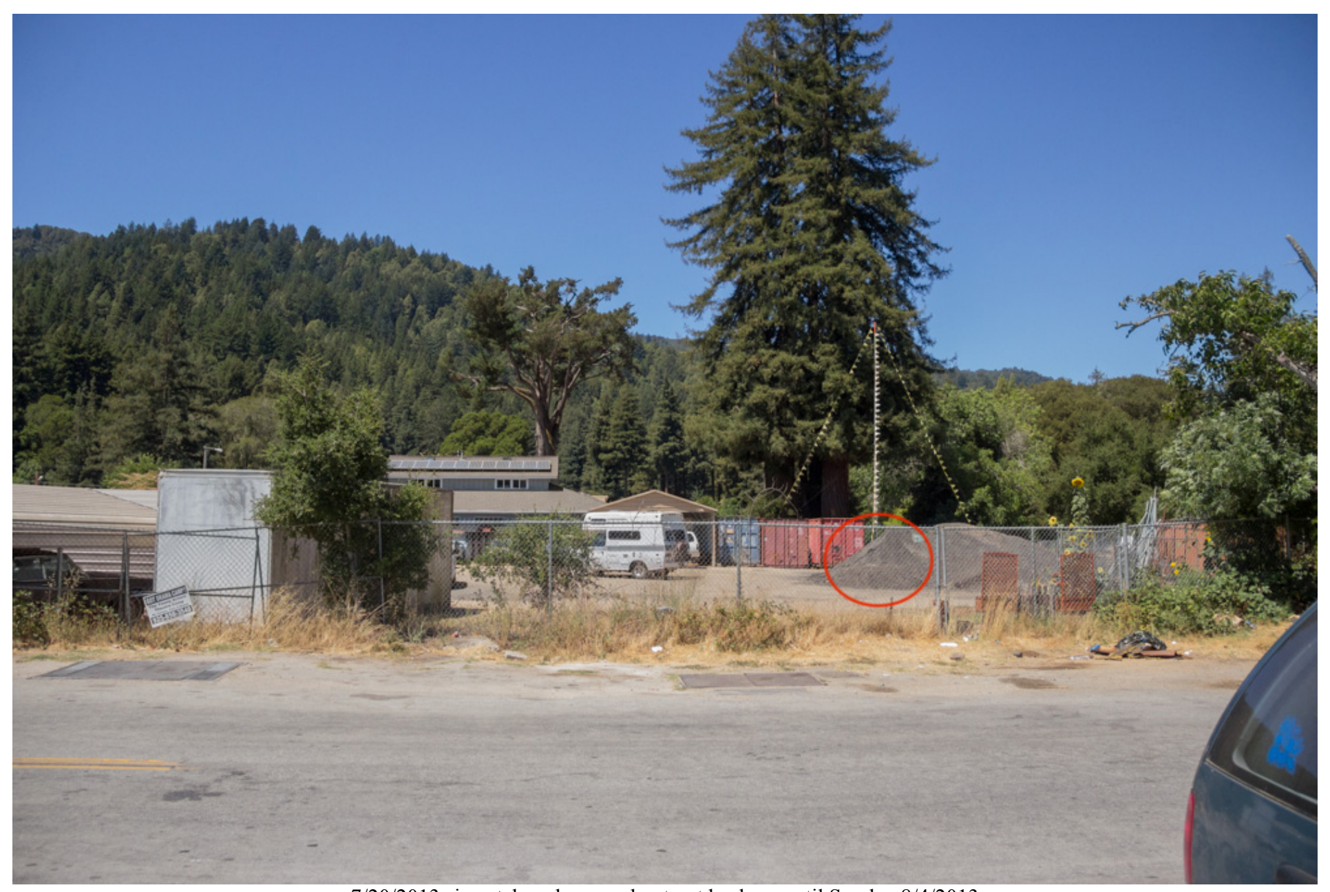
7/20/2013 signs taken down and not put back up until Sunday 8/4/2013