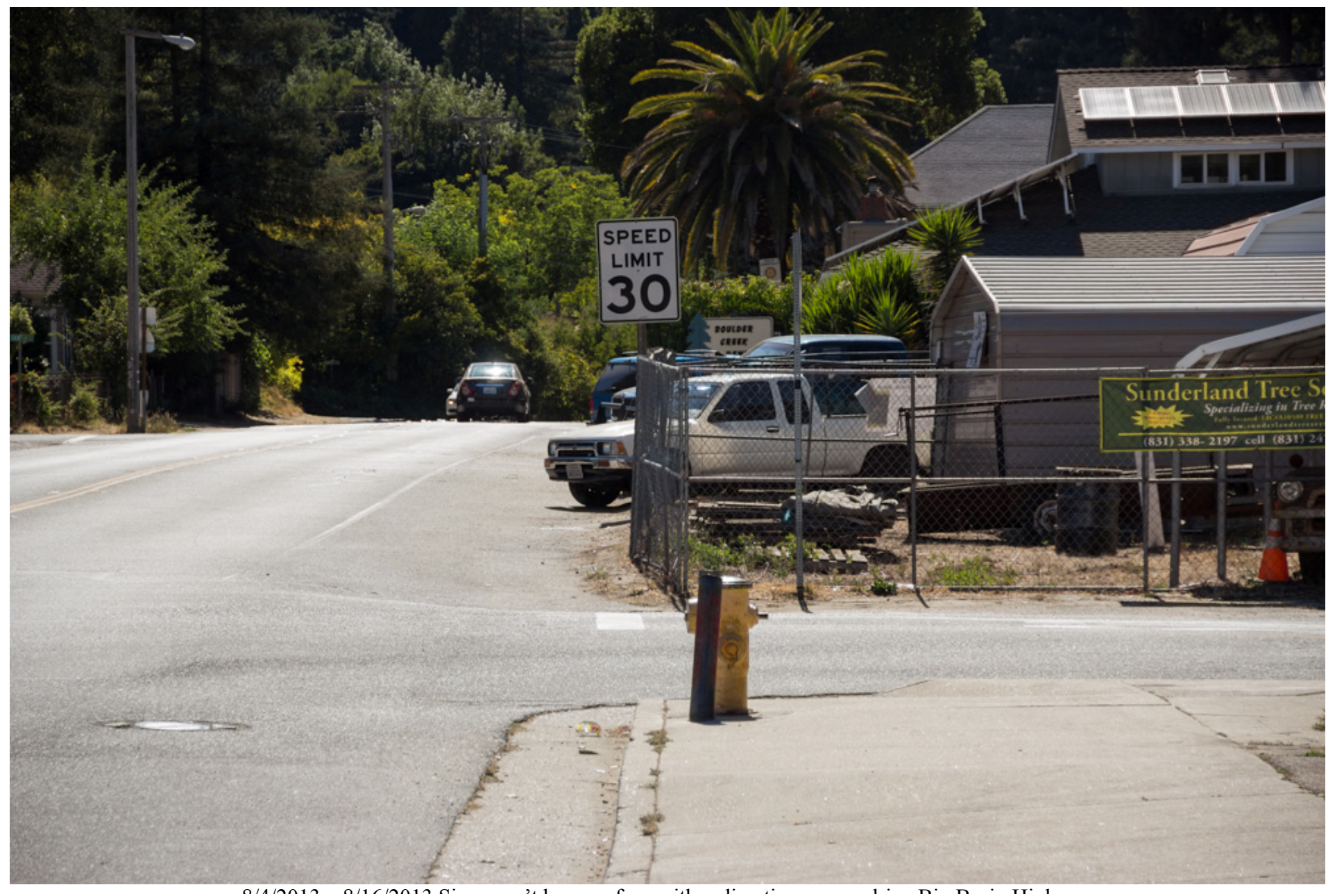
8/4/2013 – 8/16/2013 Signs can't be seen from either direction as you drive Big Basin Highway