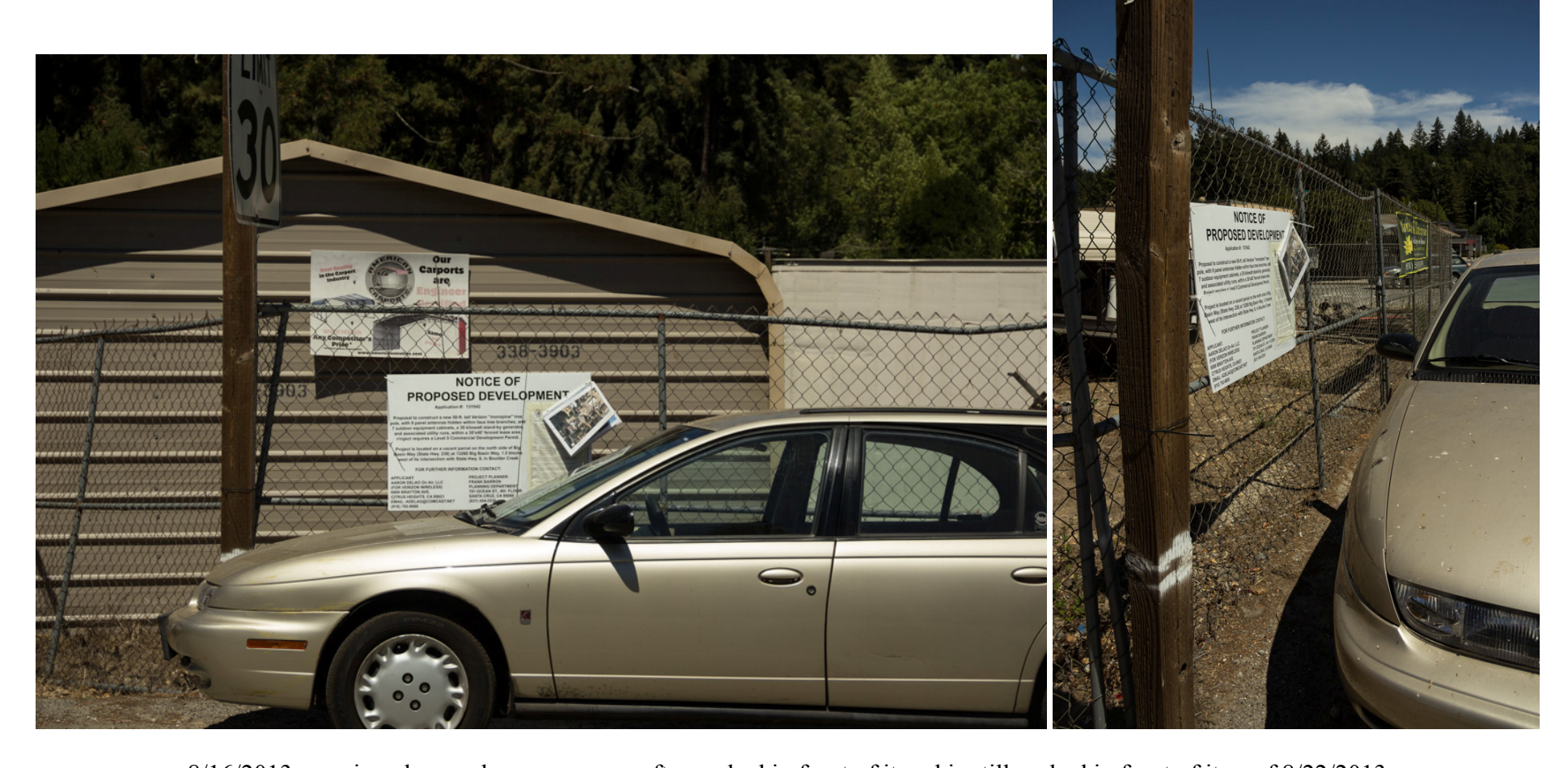
8/16/2013 one signed moved, car was soon after parked in front of it and is still parked in front of it as of 8/22/2013 previous location can be seen on page 8 and 10