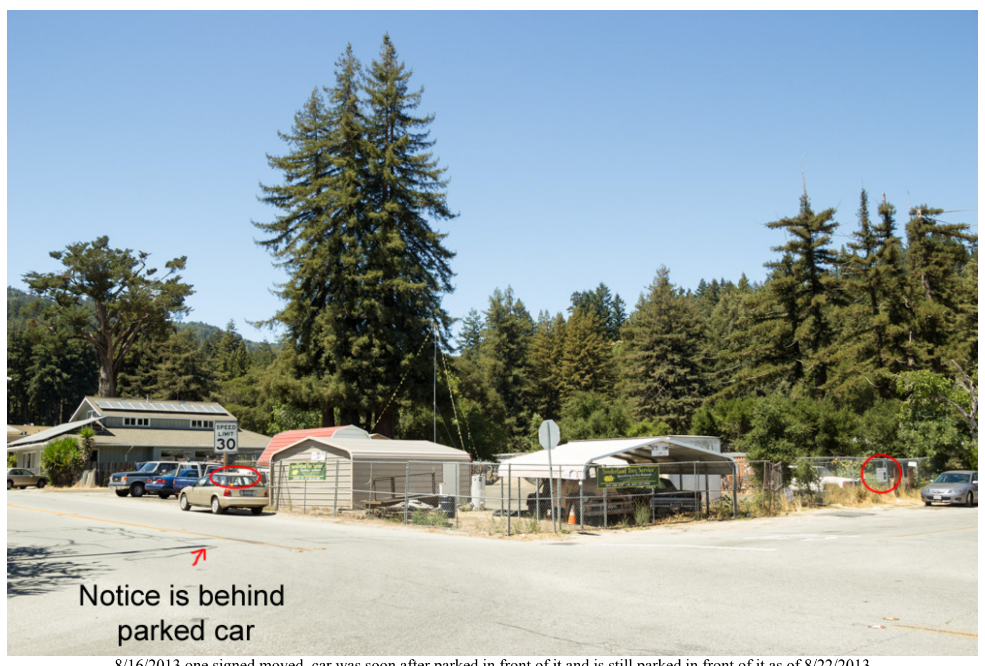
8/16/2013 one signed moved, car was soon after parked in front of it and is still parked in front of it as of 8/22/2013 previous location can be seen on page 8 and 10