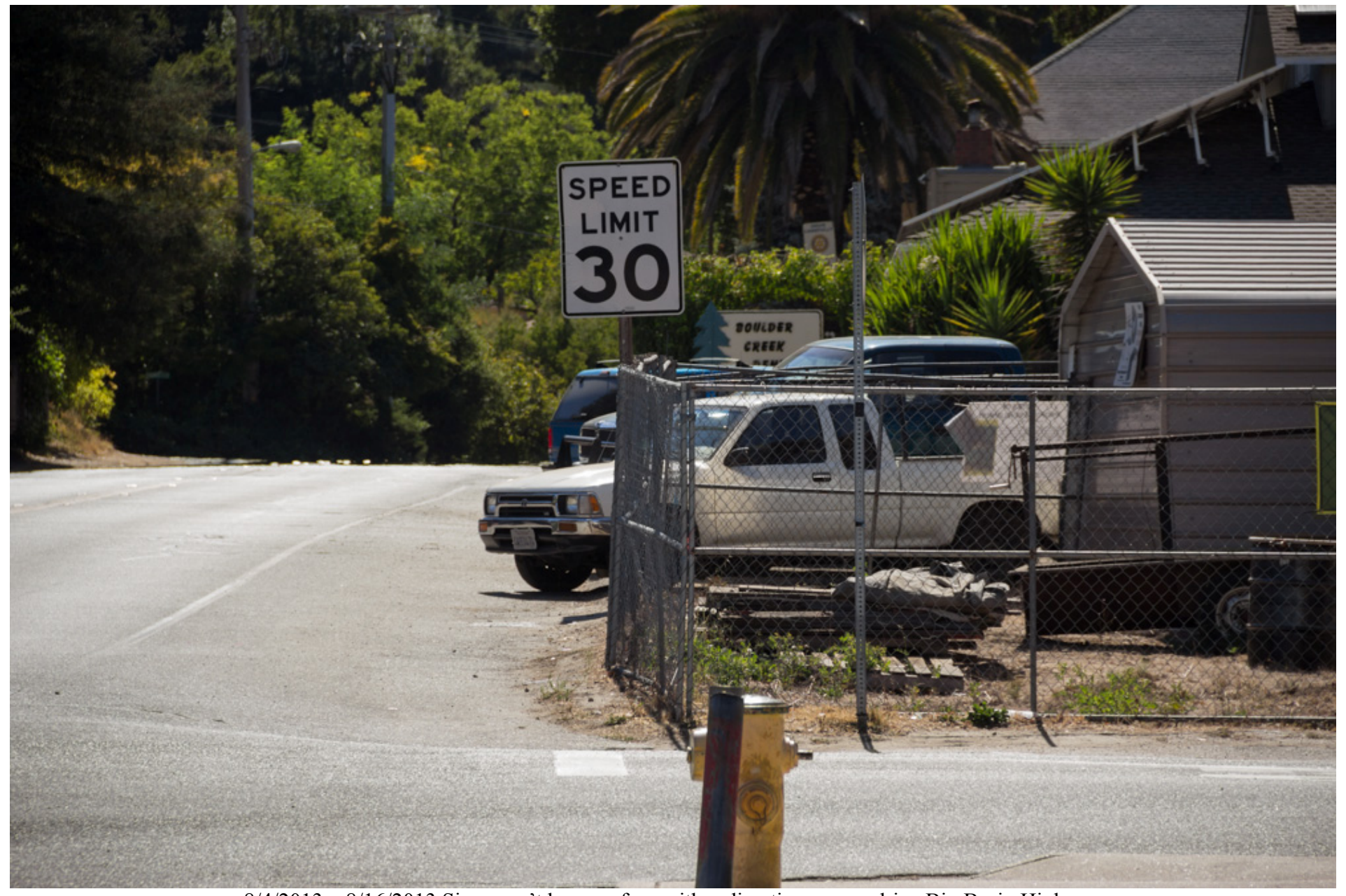
8/4/2013 – 8/16/2013 Signs can't be seen from either direction as you drive Big Basin Highway

Big Basin Highway going West, all you can see is the back of the sign