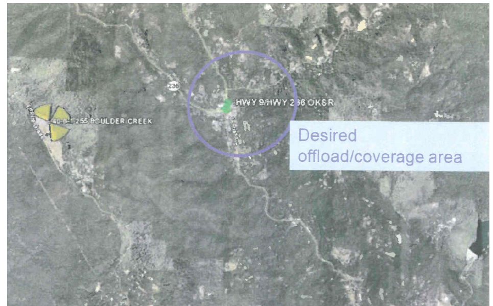
Verizon's map from page 35 of the staff report