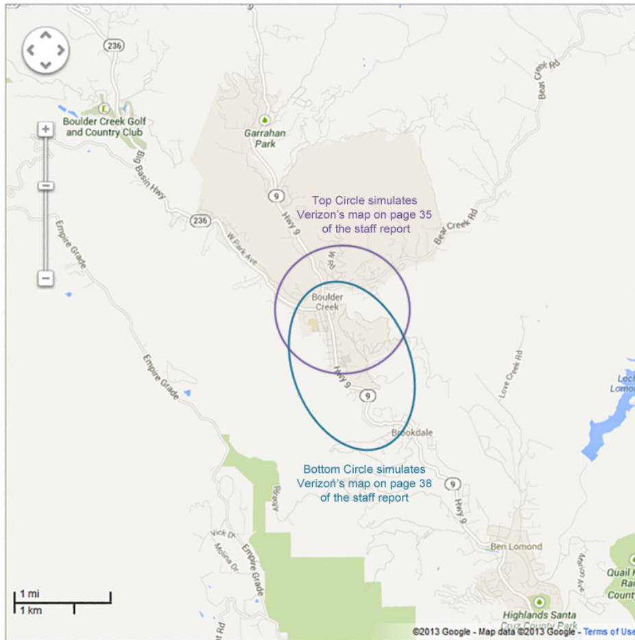
Map of Boulder Creek with simulations of Verizon's map on page 35 and 38 of the staff report