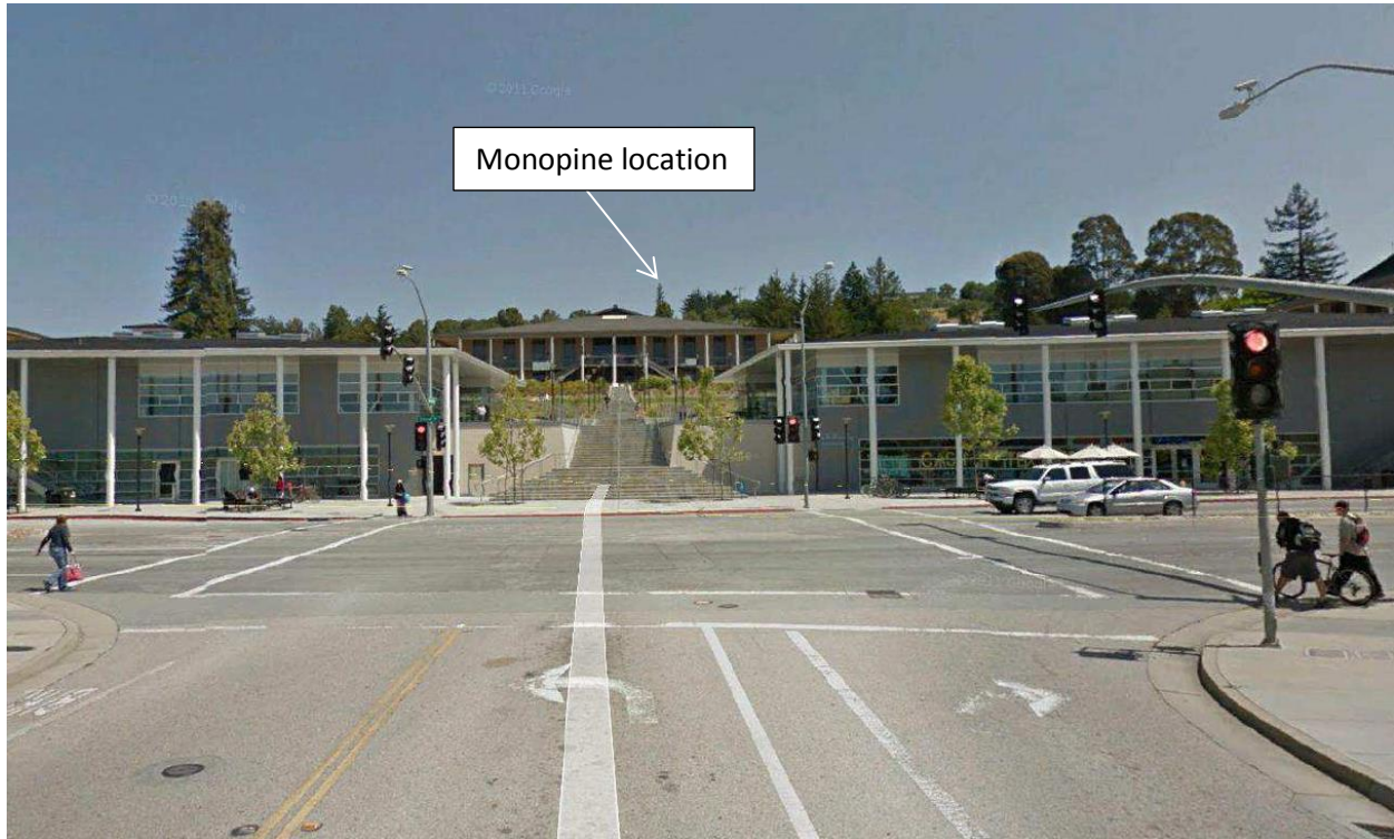
Main entrance to Cabrillo College

The site is on the hill just north of the college. If you were to take Perimeter Rd. from Soquel Dr. to the back side of the campus you will see the site. An access road leads from Perimeter Rd. to the site.